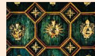
Detail from the coffered ceiling in the Knight's Hall around 1500 in the north wing