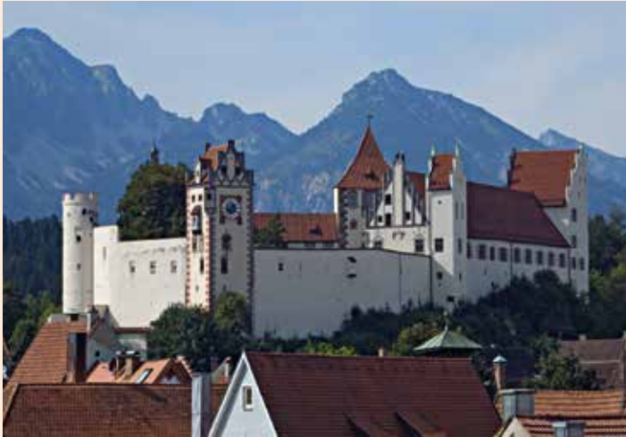
Hohes Schloss ("High Palace"), Füssen

The former summer residence of the Prince Bishops of Augsburg still dominates the townscape today. It is a magnificent example of a late gothic secular building and impresses with its splendid illusionist architectural paintings.