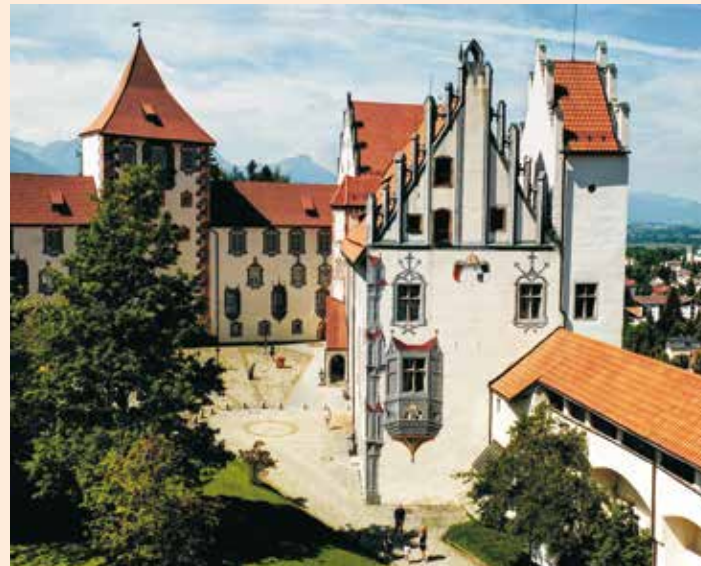
Hohes Schloss, courtyard © Foto: M. Sailer

© Editor and PrePress: Museum of Füssen Basic layout: Jung GmbH, Munich Cover picture: Stifterbild 1572 (Detail) © Bavarian State Painting Collections Print: Saxoprint, Dresden, August 2018 Subject to alterations and errors excepted