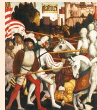
„gladius“ The War, Upper Swabia around 1500 © Bayer. Staatsgemäldesammlungen

In comparison, powerful pictures of plague and war - the scourges of mankind - carry home the historical reality of the early modern ages to the observer.