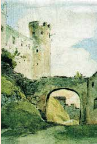
Franz Count von Pocci - way up to the High Palace, aquarelle, 1842

On permanent loan from Dr. Hermann Probst, one room shows paintings from artists of the Munich school. „The Watch“ by Carl Spitzweg,