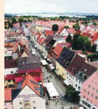
View from the Clock Tower

From the wall-walks, accessible via the State Gallery you can climb up to the Tower Room on the sixth floor of the Gate Tower and gain some insight into the way of life of a watch man. From there you have the most beautiful panorama of Füssen and the surrounding area. The dead straight road heading north is a visible link to the old Roman road the Via Claudia Augusta. Likewise, the Fall Tower on the other side of the courtyard which once served as a dungeon, is also open to the public.